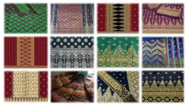
Figure 1. Various Siak Woven Fabric Motifs

According to Puguh (2012) and Akkapurlaura (2015), siak woven fabric is generally made in the form of a sealing scabbard, with the composition of the motif arrangement divided into three parts, namely the cloth head, cloth body (sow), and cloth legs. Furthermore, Mentari (2019) stated that the cloth head is located on the front and middle of the fabric, in this part usually almost all types of motifs can be used. As for the fabric legs, they are located on the edges with a motif character that is almost the same as the head of the fabric. In this section, it usually uses motifs that can connect with each other, the difference is only in the laying. Furthermore, the fabric body (sow) is a complementary part and the motifs used are usually units, for example clove flowers, mangosteen tampuk and others. The parts of the adhesive sheath cloth are presented in Figure 2.