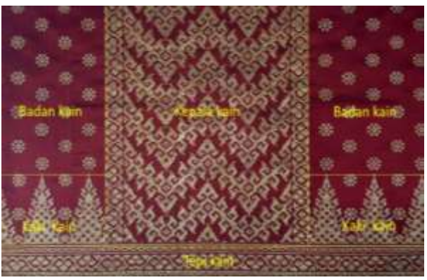
Figure 2. Layout Of Siak Woven Fabric Division

According to Puguh (2012) and Akkapurlaura (2015), siak woven fabric is generally made in the form of a sealing scabbard, with the composition of the motif arrangement divided into three parts, namely the cloth head, cloth body (sow), and cloth legs. Furthermore, Mentari (2019) stated that the cloth head is located on the front and middle of the fabric, in this part usually almost all types of motifs can be used. As for the fabric legs, they are located on the edges with a motif character that is almost the same as the head of the fabric. In this section, it usually uses motifs that can connect with each other, the difference is only in the laying. Furthermore, the fabric body (sow) is a complementary part and the motifs used are usually units, for example clove flowers, mangosteen tampuk and others. The parts of the adhesive sheath cloth are presented in Figure 2.