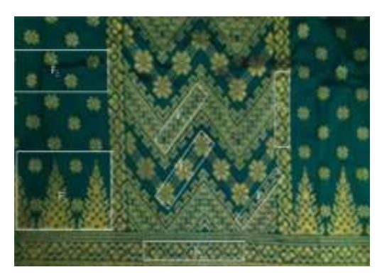
Figure 18. Siak Woven Scabbard Fabric

The Siak woven fabric motifs used as samples for each of the above patterns are the most widely produced by weavers in Siak Sri Indrapura and in Pekanbaru City. The craftsmen have become accustomed to using this pattern so that to make woven fabrics with this pattern is felt to be younger and faster. From the overall siak woven fabric motifs identified, it turns out that all of them form patterns that can be classified using the frieze pattern. There has not been found a Siak woven fabric, sometimes there is a combination of various patterns, for example in Figure 18.